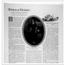
Women as Dictators