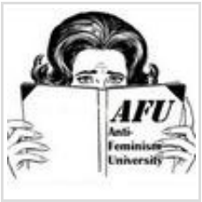
Remove the Needs