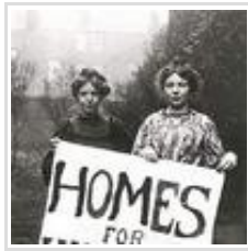
Feminism Making a Tomcat of Father